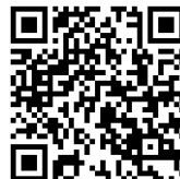
TC-267 FR Part A SDS