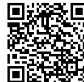
TC-267 FR Part B SDS