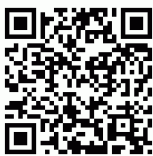
Scan QR code to see our How-to Foam Video

Refer to the Material Safety Data Sheet before using this product.