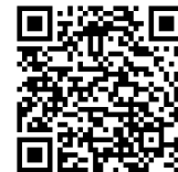
TC-296 FR Part B SDS