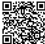
TC-296 FR Part A SDS