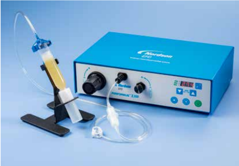
Performus X dispensers provide reliable dispensing for general applications in a wide range of industries.

Reliable benchtop fluid dispensing control for general applications