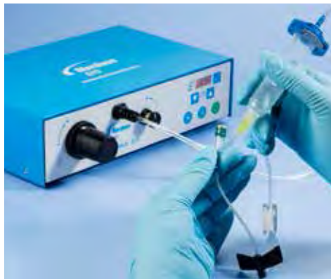
Dispensing a low-viscosity solvent on medical devices.

Nordson EFD's Performus™ X dispensers increase throughput, improve yields, and reduce production costs through controlled application of adhesives, lubricants, and other assembly fluids.