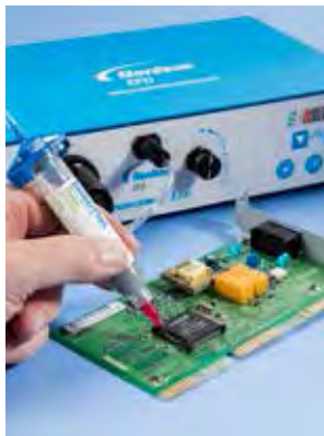
Dispensing SolderPlus® solder paste on PCB boards.