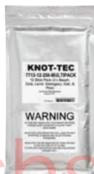
12 Stick test pack (6 colours x 2 sticks)