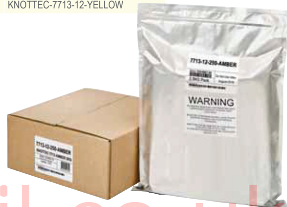
5kg (11lbs) Bulk packs (2 x 2.5kg (5½lbs) bags) (Single colour)