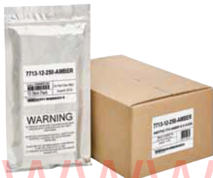
Box of 10 x 10 Stick packs (Single colour)