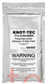
10 Stick pack (Single colour)